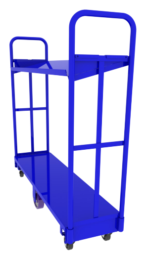
5000101 U-Boat shown with Slant Shelf #8010218 great for stocking and picking with bins