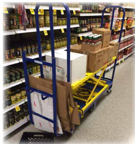
1660 u-boat #5000197 shown with spring leveling shelf #8010159 and cardboard holder attachment #48010108

(4) 4" x 1.25" corner swivel casters. Replacement order #B000027