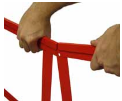
Snap Together Design