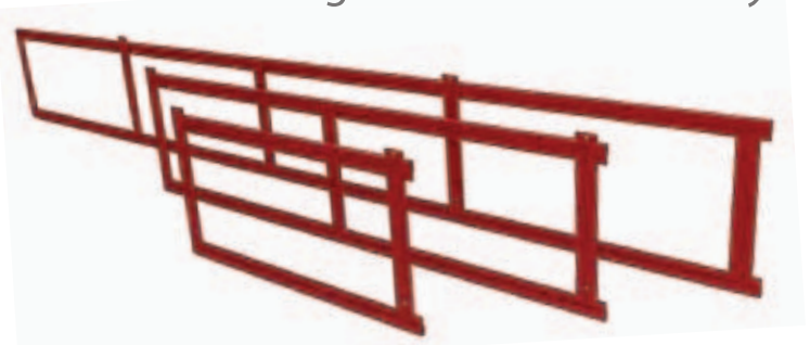
Adjustable Hanging Locations